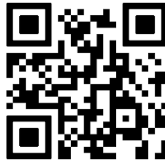
QR CODE FOR THE SPSCC.EDU/CCE WEB PAGE

2. Search or browse the class offerings.